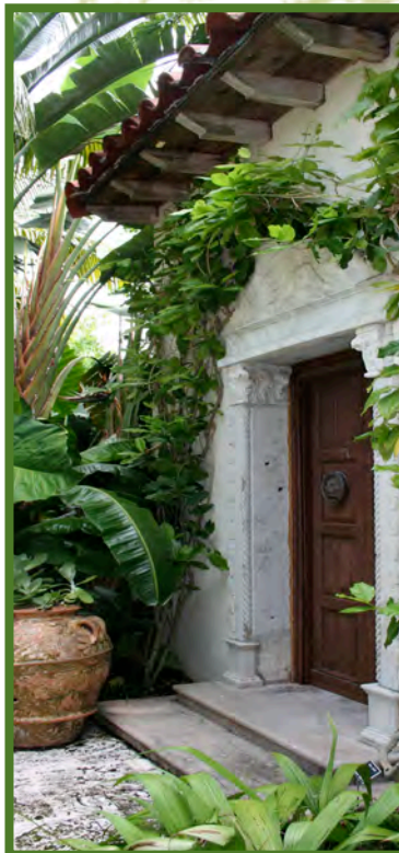
Spanish Garden: This facade is located in one of nine demonstration gardens at the Four Arts.