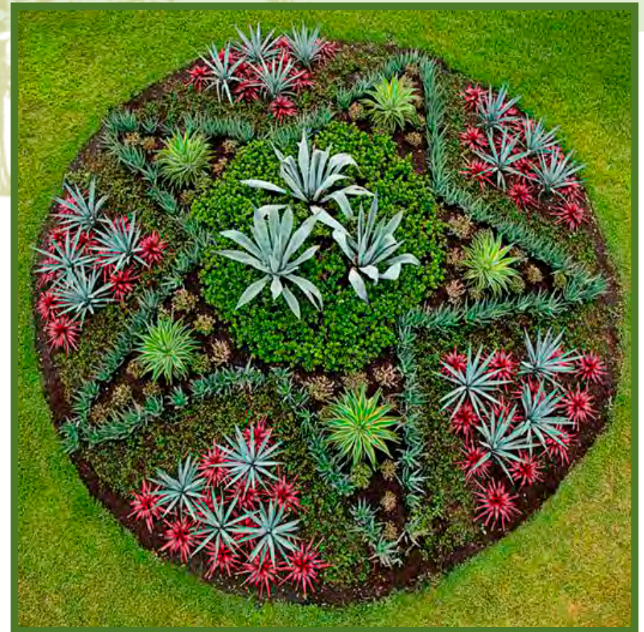
Kaleidoscope Flower Beds: This gift to the town in 2010 is located along the Royal Poinciana Way median. These eight unique beds show the beauty and advantages of xeriscape landscaping.