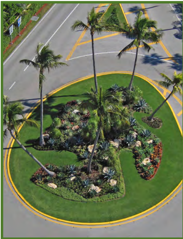
Southern Oasis Traffic Circle: This gift to the Town of Palm Beach Centennial, dedicated in 2010, incorporates drought, salt tolerant and cold hardy plants.